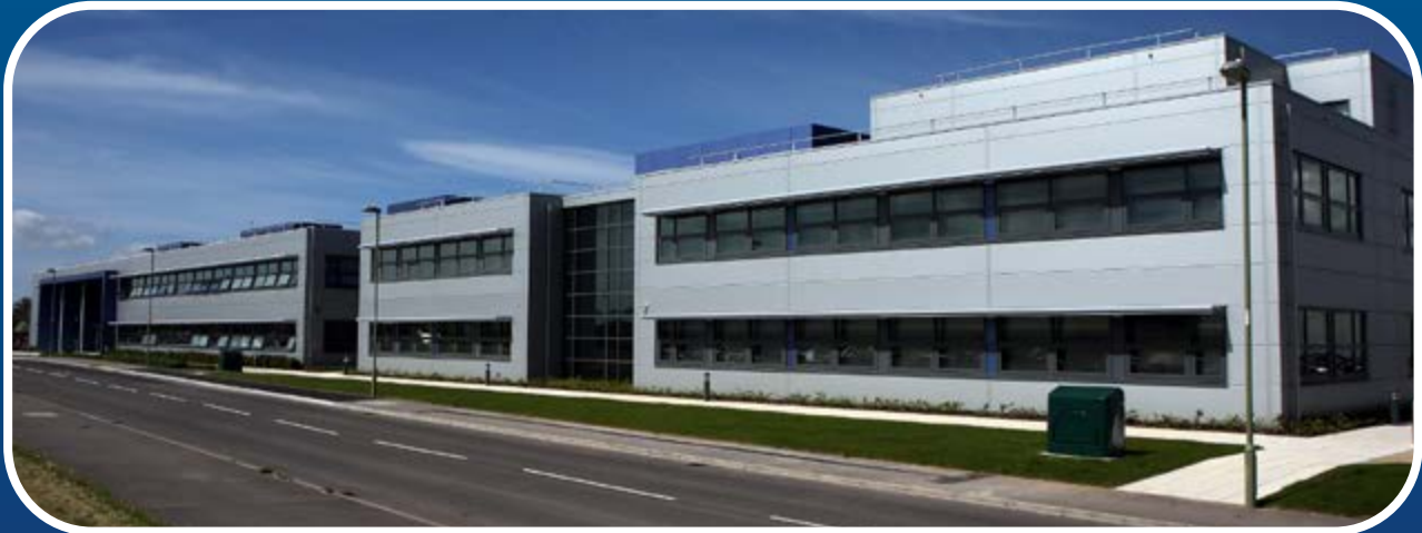
Fareham Innovation Centre extended in 2018