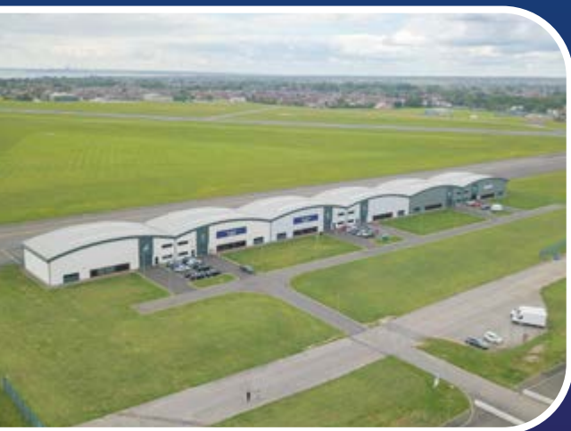
Six new hangars completed in 2018