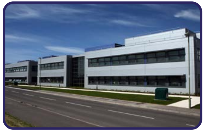
FAREHAM INNOVATION CENTRE