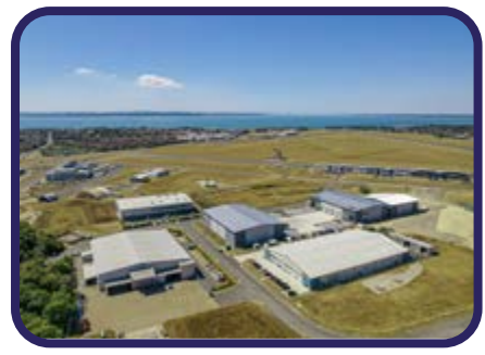
PURPOSE-BUILT BUSINESS UNITS