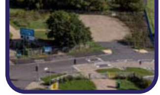
SECURE GATED ENTRANCE