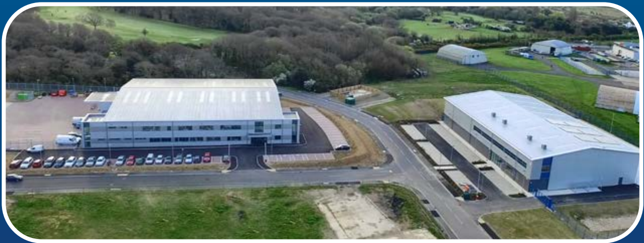
UTP (left) and PropTech Aero (right)