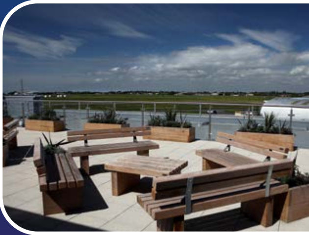
.. features an outdoor terrace