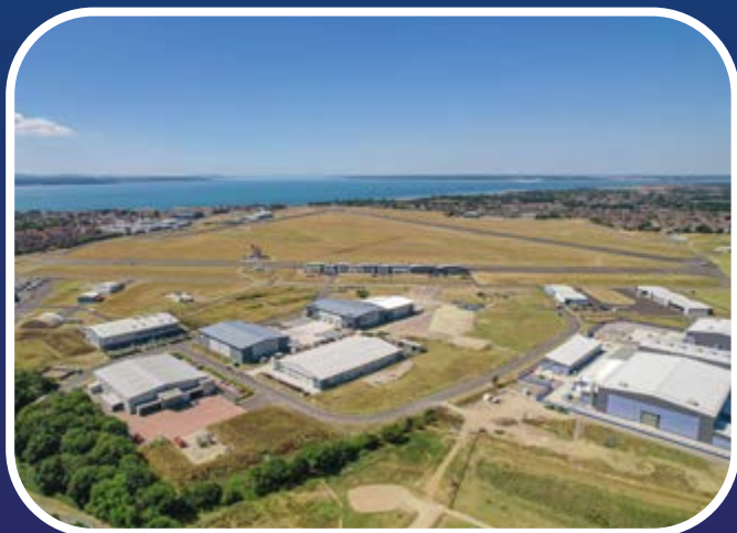
New road network and supporting infrastructure