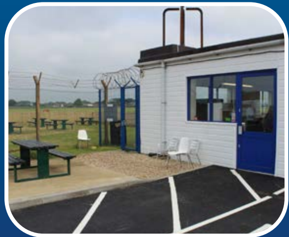
Café @ 05