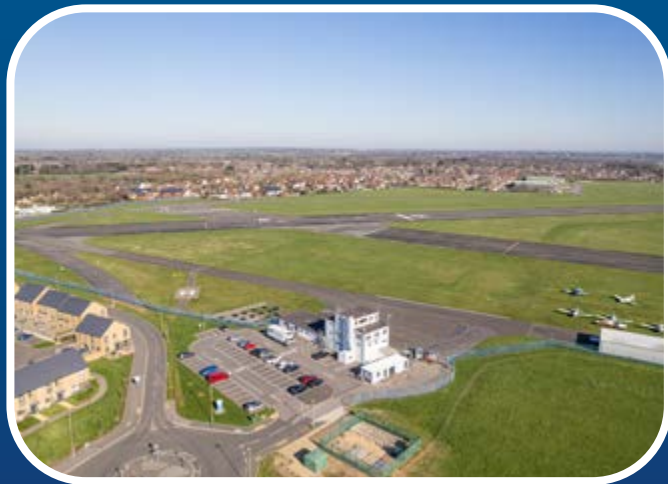
Control tower and runway improvements