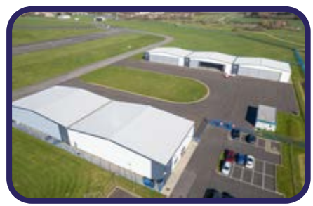
5 GENERAL AVIATION HANGARS