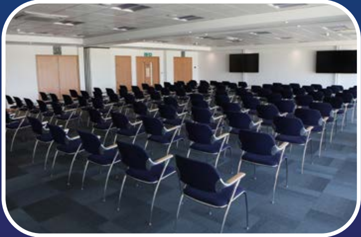
The Bridge Conference Suite...