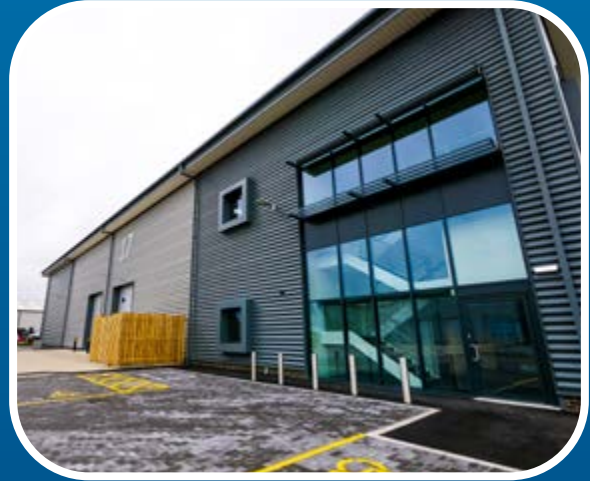
New speculative units completed in 2022